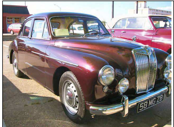
Wayne and Isabel Hardy's 1958 MG Magnette at the 57th Texas Tour

Calvert Texas and the Cocoamoda Chocolate Factory (Yummy), bus tour of the many beautiful Victorian homes built around the turn of the last century in Calvert, and Friday night banquet with Style Show of period antique clothes.