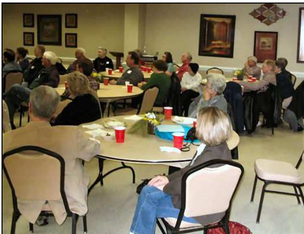
Club members listening to interesting stories about past and present Texas Rangers activities at our Bring a Dish Dinner on January 15th.