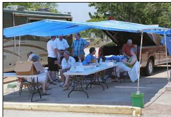
I was very hot "again" at the car show this year and we were looking for cover from the sun.