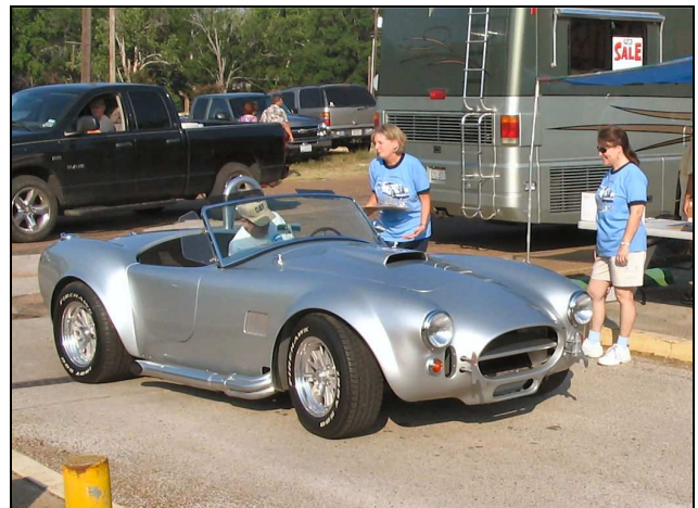
The registration ladies doing their thing at the Deja Blue Car Show on June 11th.