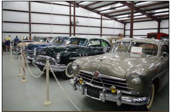
Just a small sample of the fine autos you will see at the Martin Collection near Broadus, Texas when we revisit it on October 15th.

A BAD DAY OF FISHING IS BETTER THAN A GOOD DAY AT WORK. HAPPY LABOR DAY!