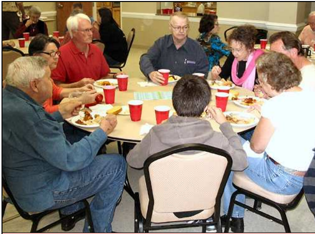
Club members enjoying good conversation and good food at our "Bring a dish Dinner" January 21st.