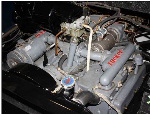
Engine picture of the 1948 Tucker that we saw when viewing the O'Quinn Collection in 2009. Note: One just like this sold at the recent Barrett Jackson Auction on January 22nd for over $2,000,000.00!

Our last director's meeting was held on January 30 th and we spent most of that time putting together our club's calendar of events for the coming year. For your future planning, please make note of these events and dates listed in the newsletter as "2012 Calendar of Events".