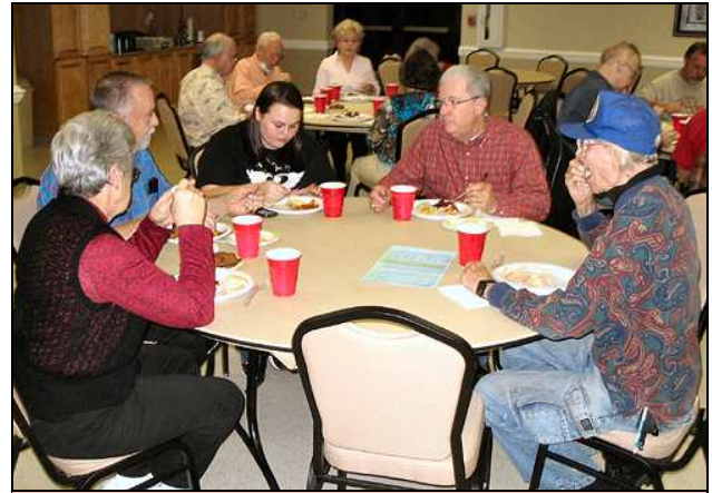
Club members enjoying the food at our "Bring a Dish Dinner" at New Hope Church on January 21st.