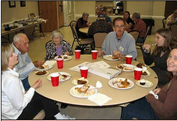
Club members enjoying their food and awaiting our program at our "Bring a Dish Dinner" on January 21st.