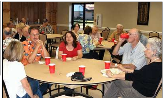
Club members waiting for me to set up the equipment to show some old "Laurel & Hardy" movies at our "Bring a Dish" dinner on April 21st.