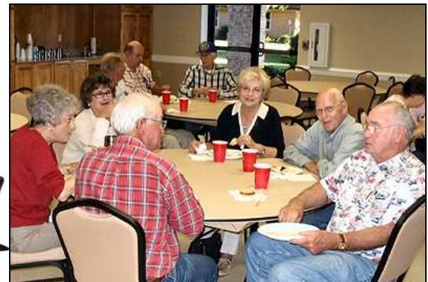
Club members enjoying some good conversation at our "Bring a Dish" dinner on Saturday April 21st at New Hope Church.