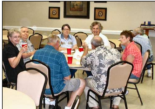
Club members enjoying the usual fine food that is brought to our "Bring a Dish Dinner" on September 15 th.