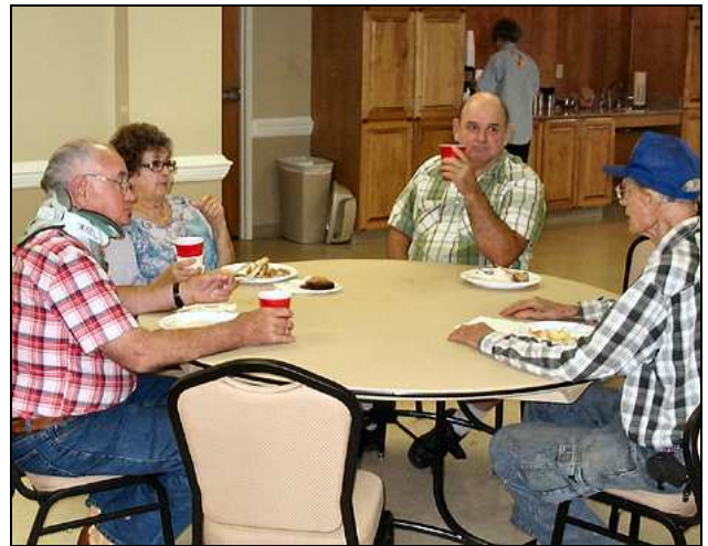
Some serious conversations going on at our recent "Bring a Dish dinner Movie Night" on September 15th at New Hope Church.

Our Annual dues for the National AACA club ($35) and the local DETR club ($20) will be due soon. You can pay both with one check for $55 that is made out for DETR-AACA and mailed to: DETR P.O. Box 935291 Nacogdoches, Tx 75963