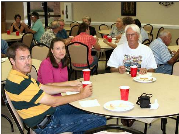
Here we are, waiting for the movies to start at our "Bring a Dish Movie Night" on September 15th at New Hope Church.